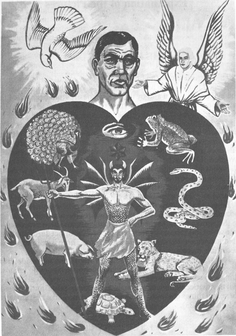
1. The sinner's heart